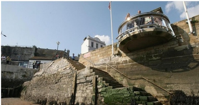
1934 Steps & Observation Deck

A set of steps built in Plymouth, England in 1934 commemorates the location where the Pilgrims are said to have left England on the Mayflower (400 years ago in 1620) to settle in North America. Tourists have flocked here for decades to view and photograph the Pilgrims’ historic point of departure. However, many say that the actual location of the steps is not where tourists line up every year, but rather a few feet away, beneath the ladies toilets in the Admiral MacBride pub, which was built over the original steps some 300 years ago. This would put the possible locale of some of the most famous steps in history in a surprising, yet cheeky spot!