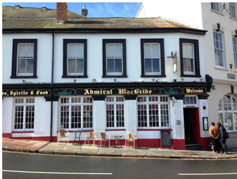
The Admiral MacBride