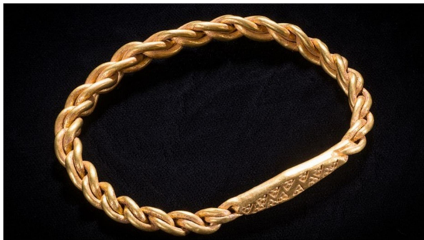
Gold Arm Ring

For additional reading, visit https://www.bbc.com/news/world-europe-isle-of-man-56111192