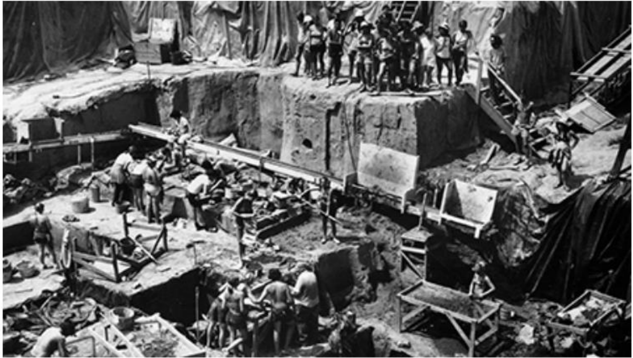
The Koster Site – 9000 Years of Living on the Land

Sponsored by the South Suburban Archaeological Society, a 501(c)3 not-for-profit organization; labor donated