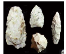
Vincennes/Cottage Grove/Sauk Trail junction artifacts