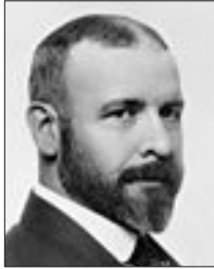
Louis H. Sullivan